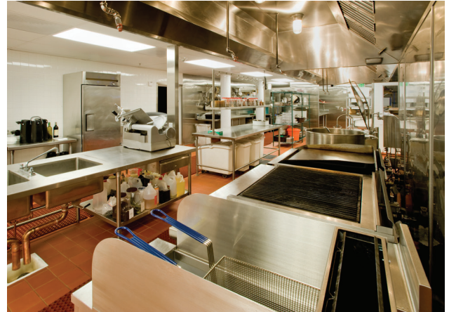
This photo illustrates the correct installation of a metal baffle plate between the open flames from the range and the deep fat fryer. Metal baffles should be used only when there is not sufficient space available to provide a 16" clearance between the deep fat fryer and any source of open flames. Baffle filters are seen above the range and fryer.